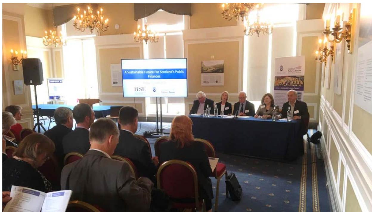
A Sustainable Future for Scotland's Public Finances, 15 June 2018, at the Royal Society of Edinburgh