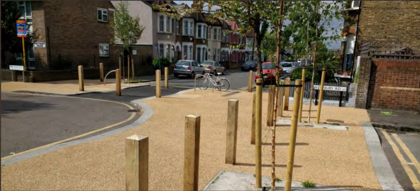
We Support WF MH @WeSupportWFMH · Apr 23 Improved public space on Hatherley Rd E17. Once a rat-run for thousands of drivers each day. #wfminiholland @willnorman #doublefilter