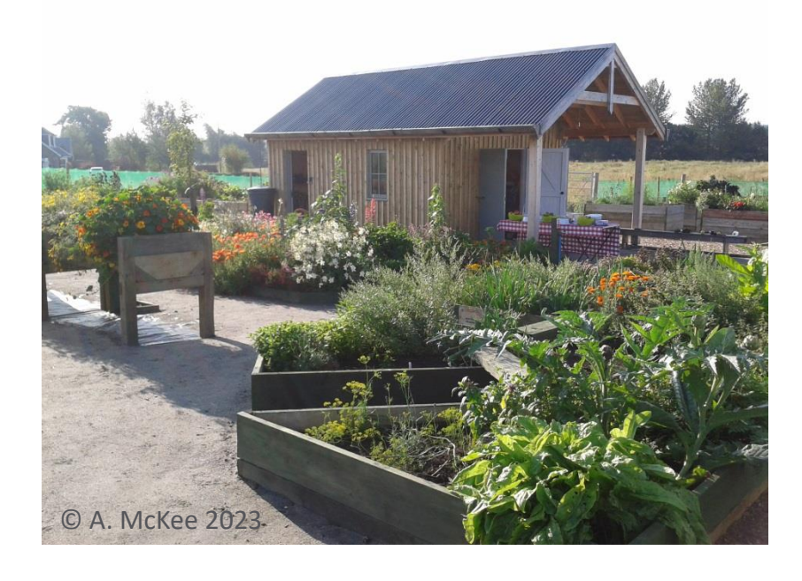
Tarland Community Garden, Aberdeenshire